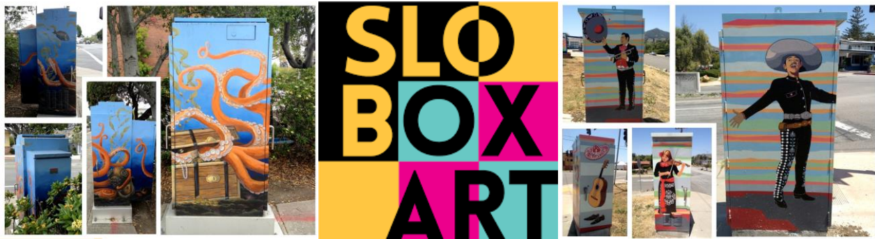
artist collen gnos

Utility boxes will be cleaned and primed prior to the first day of painting. Painting is scheduled to occur in Summer 2018* (*Final Dates TBD). All selected artists must be available to paint during this time. Upon completion, each box will be sealed with a UV anti-graffiti clear coat sealant.