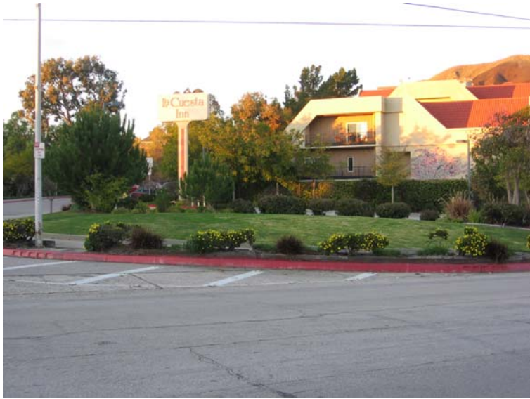
Buena Vista Avenue and Garfield Street at Monterey Street Site of proposed public art piece